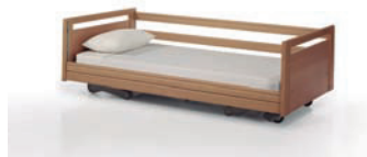
Minimum height: 19cm.