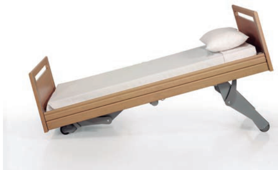
Trendelenburg \pm 16^\circ

Our high quality products, reduce time for cleaning up to 30%. Smooth surfaces and detachable panels allow a quick and easy cleaning and disinfection.