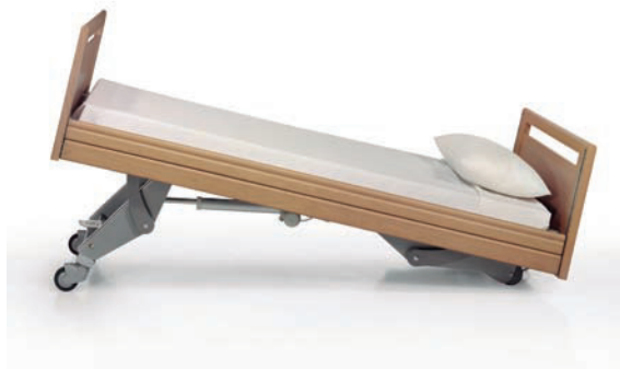
Reverse trendelenburg \pm 16^\circ

Ergonomic head and footboard panels that help manoeuvring the bed. The materials used (varnished beech) meet all the necessary requirements for hygiene and cleaning.