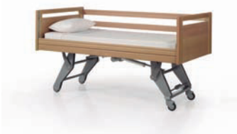
Maximum height: 68cm.

The cardiac chair position is essential for patients with heart and breathing problems, helping to enhance their recovery.